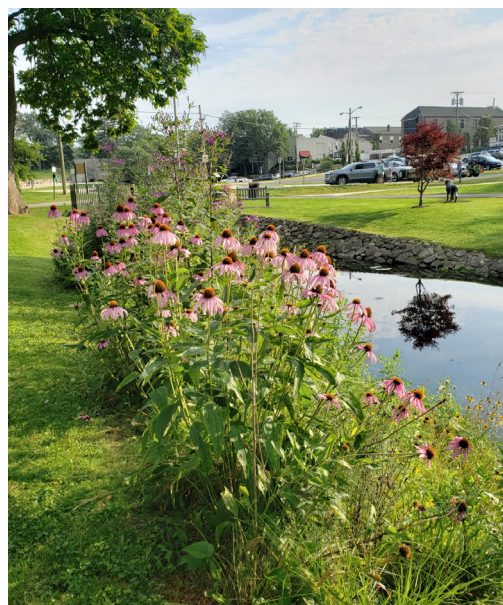
Riparian buffer at Depot Park in Clarkston, MI.

Shoreline protection using native plants is called a “riparian buffer. This is a planted strip along a shoreline, stream, or riverbank. This keeps the shoreline from washing away, provides habitat, and filters pollutants out before they enter the water.